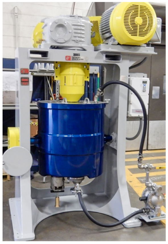
Figure 2 Batch Attritor

Maximum feed material size can be up to 10mm, provided the material is friable. Otherwise any ~10 mesh material can be processed in the batch type Attritor. When used for dry grinding, the batch Attritor can be operated in either a batch or continuous-feed mode.